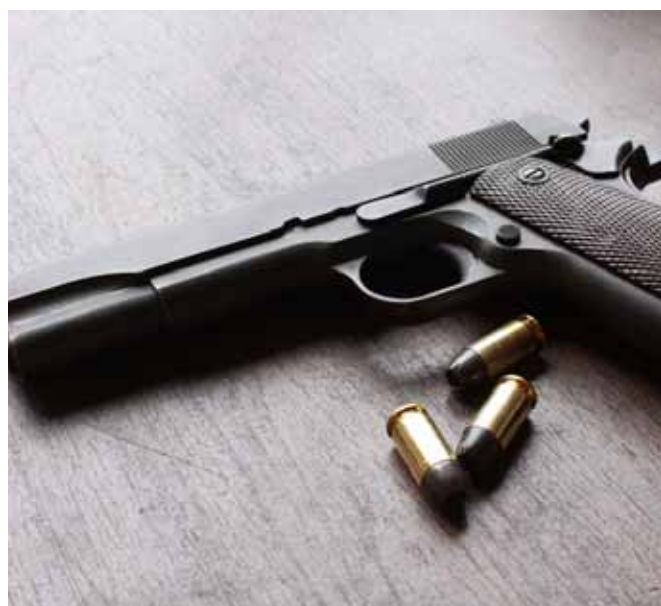
Control of the lucrative drug trade has defaulted to organised crime

The 1961 UN Single Convention on Narcotic Drugs, the legal foundation of the global drug war, has two parallel and interrelated functions. Alongside establishing a global prohibition of certain drugs for non-medical use, the convention also strictly regulates many of the same drugs for scientific and medical uses. These functions have led to parallel markets: one for medical drugs, controlled and regulated by state and UN institutions; the other for non-medical drugs, unregulated and instead controlled by organised criminals.