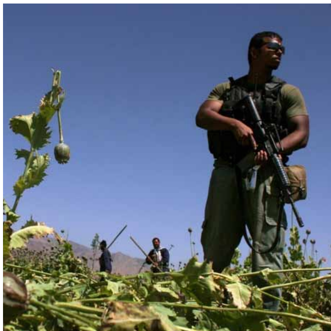
In financial terms, the enforcement-led approach to drugs has been staggeringly wasteful