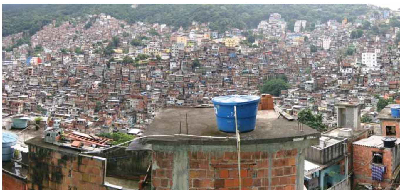
Drug profits are used by criminal organisations to enhance their power and undermine institutions in developing countries

Migration is a further consequence of violence, as people move away to safer regions out of fear for their lives. In Tamaulipas in Mexico, drug-war migration has left virtual ghost towns across the region and many businesses have relocated as a result. (44)