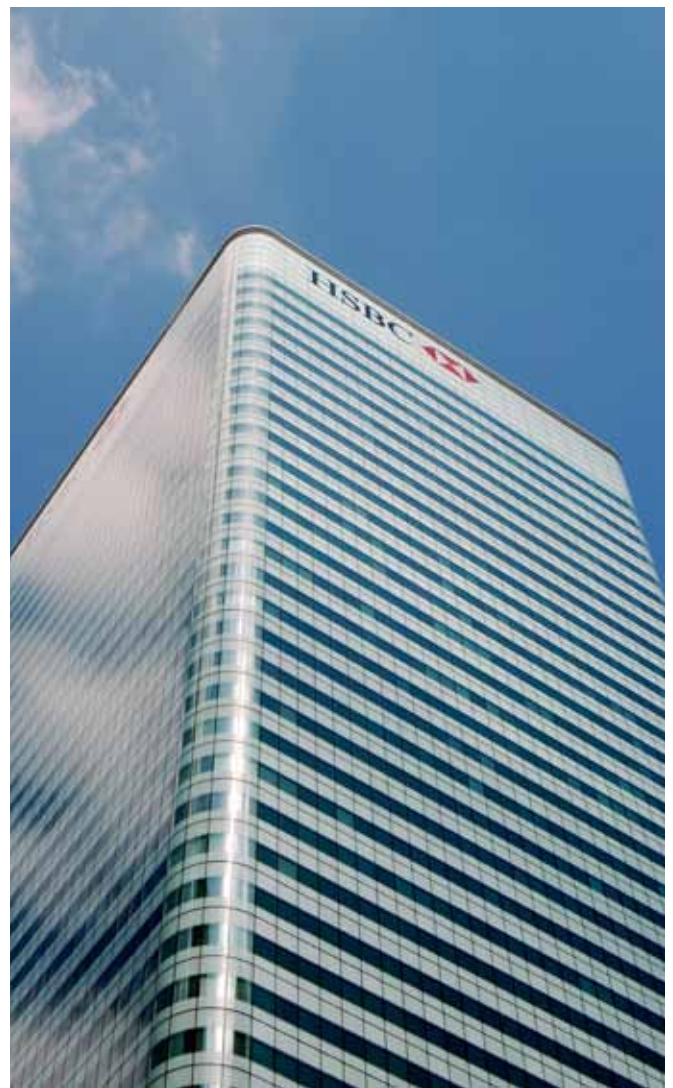
Major financial institutions have been complicit in the illicit drug trade

The problem, however, appears to be a political rather than practical one. In some cases, political constraints or legal mandates actively prevent exploring alternatives. (56) When those responsible for developing and implementing drug policies are unable to assess options that at least have the potential to deliver better economic outcomes (whether one agrees with them or not), it is clear that we are operating in a political arena shaped by something other than evidence of cost-effectiveness.