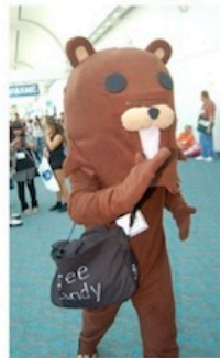
"PedoBear" as the original Internet meme on left, and the incarnation of "PedoBear" handing out Free Candy at San Diego's Comic Con.