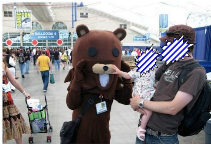
PedoBear posing for photos with attendees at San Diego's Comic Con.

At the San Diego Comic Con 2010 in July of this year, law enforcement discovered an individual dressed in a PedoBear costume, handing out candy and being photographed in contact with attendees, including multiple children. Once identified, the young man and his costume were excluded from the family-friendly event.